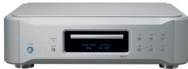
K-07Xs Super Audio CD/CD Player

Employing the “VOSP” mechanism, a full-fledged model with all-new audio circuits with the essence of the K1, and a powerful output buffer amplifier and power supply unit.