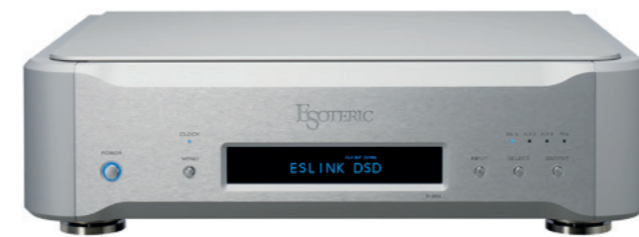
D-05X 34bit Dual-monaural D/A Converter