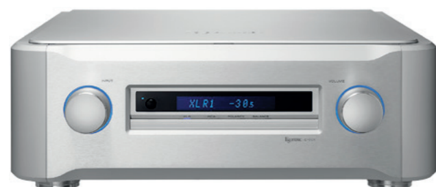
C-02X Stereo Linestage Preamplifier

Inheriting the expressive power of the Grandioso C1. A dual mono preamplifier that accommodates five built-in power transformers