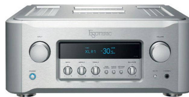
F-05 Integrated Amplifier

Fully balanced circuit design on preamplifier section. Employing a high power amplifier module inherited from the upper separate models.