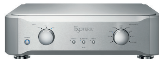
E-02 Balanced Phonostage Amplifier

This MC/MM-compatible phono amplifier is an apex of vinyl playback. Especially, providing fully balanced transmission and amplification on all MC cartridges.