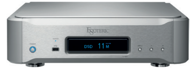
N-03T Network Audio Transport

Now supports ESOTERIC’s original digital transmission standard “ES-LINK”. Network audio player x DAC with rich DAC functions.