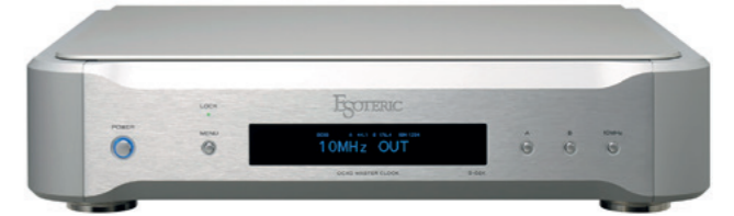
G-02X Master Clock Generator

A rubidium clock generator that inherits technologies of the Grandioso G1, supporting various clock formats.