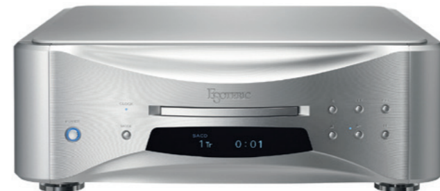
Grandioso K1X Super Audio CD Player

The VRDS-ATLAS, and Master Sound Discrete DAC. Now, fruited to an integrated Super Audio CD player in the name of Grandioso.