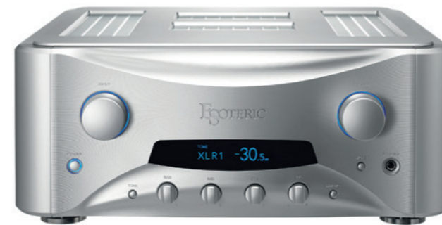
Grandioso F1 Integrated Amplifier

An all new preamplifier employing ultra precise attenuator and integrated discrete amplifier modules that define new horizon of ESOTERIC amplifiers for new era.