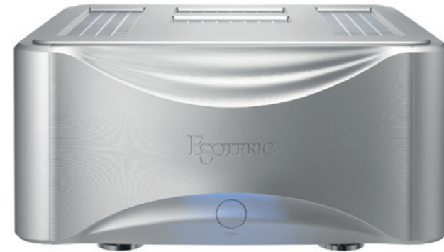
Grandioso S1 Stereo Power Amplifier

Faithfully reproduce the dynamics of music. A monaural power amplifier gifted with a driving force that deserves for the flagship model.