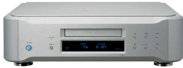
P-05X Super Audio CD Transport

A new milestone cultivated by 30 years of tradition, the P-05X accommodates the VRDS NEO mechanism and the axial sliding pick-up for excellent signal reading.