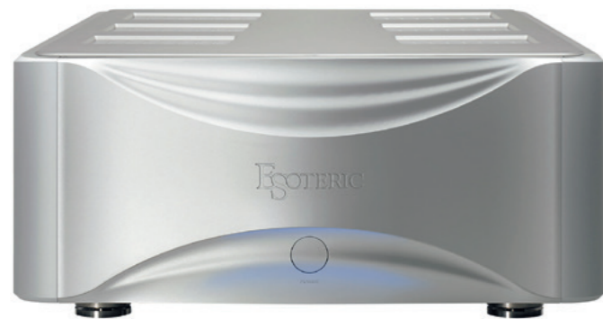
Grandioso M1 Monoblock Amplifier

A reference model for the master clock generator.