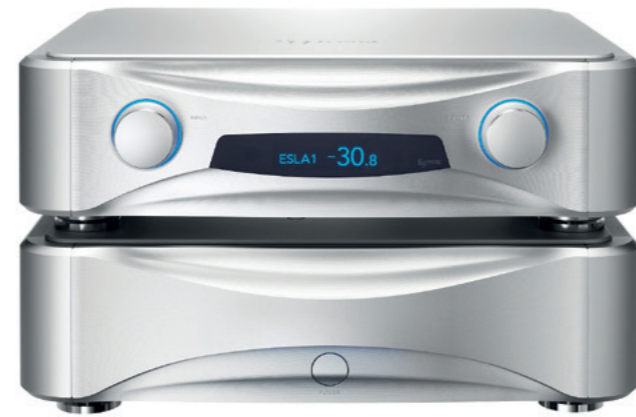
Grandioso C1X Linestage Preamplifier

An all new preamplifier employing ultra precise attenuator and integrated discrete amplifier modules that define new horizon of ESOTERIC amplifiers for new era.