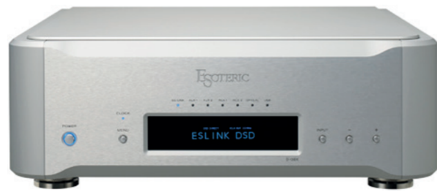
D-02X 36bit Dual-monaural D/A Converter

A design concept of the Grandioso is condensed into a dual mono unit.