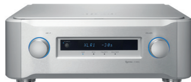
C-03Xs Stereo Linestage Preamplifier

Inheriting the expressive power of the Grandioso C1. A dual mono preamplifier that accommodates five built-in power transformers