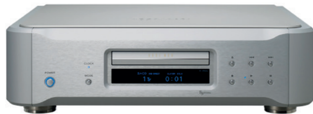
K-05Xs Super Audio CD/CD Player

Accommodating the VRDS-NEO “VMK-5” mechanism. The core model of the K series with a dual mono D/A converter that follows the Grandioso K1’s DAC platform.