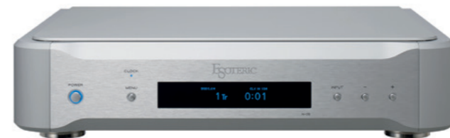
N-05 Network Audio Player

Providing flexible access to the music and excellent sound quality while playback. A network audio player that fulfils luxury dreams.