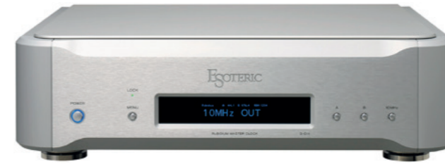
G-01X Master Clock Generator

A rubidium clock generator that inherits technologies of the Grandioso G1, supporting various clock formats.