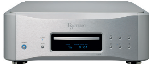
K-03XD Super Audio CD/CD Player

Eventually, the K-03 series acquires a new master VRDS “ATLAS 03” mechanism with a high degree of perfection, and full in-house designed “Master Sound Discrete DAC”.