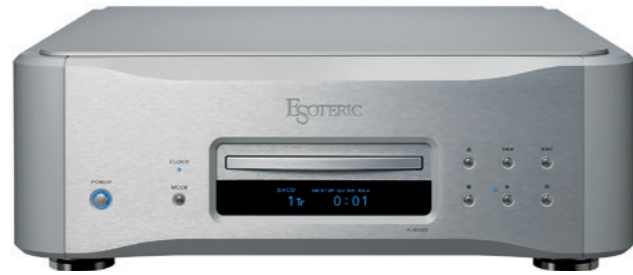
K-01XD Super Audio CD/CD Player

Finally, the K-01 series sublimates with a new VRDS “ATLAS 01” mechanism inherited from Grandioso, and full in-house designed “Master Sound Discrete DAC”.