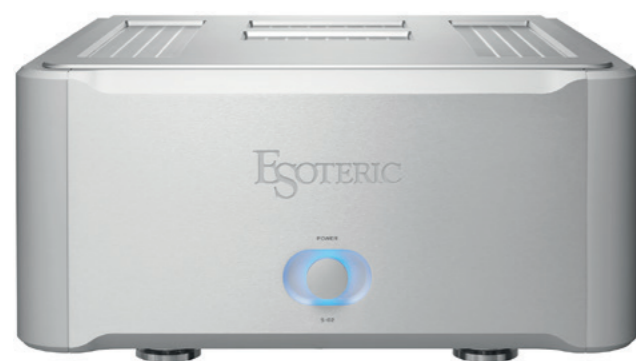
S-02 Stereo Power Amplifier

With overwhelming amounts of material, including powerful power supply section. A stereo power amplifier that inherits the idea of Grandioso.