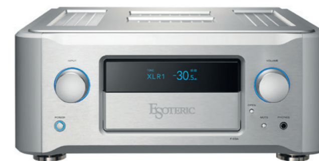
F-03A Integrated Amplifier

The basic style but completed. Equipped with a class-A amplifier and a fully balanced preamplifier direct descendant of the Grandioso.