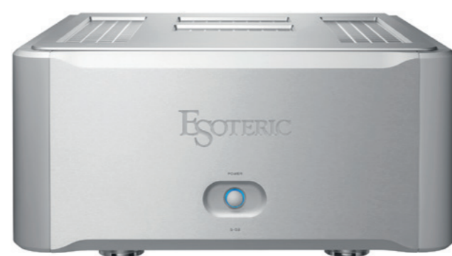
S-03 Stereo Power Amplifier

With overwhelming amounts of material, including powerful power supply section. A stereo power amplifier that inherits the idea of Grandioso.