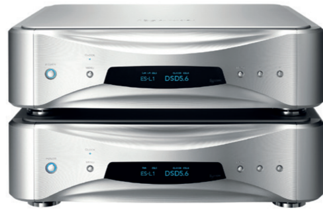
Sold in stereo configuration as shown.