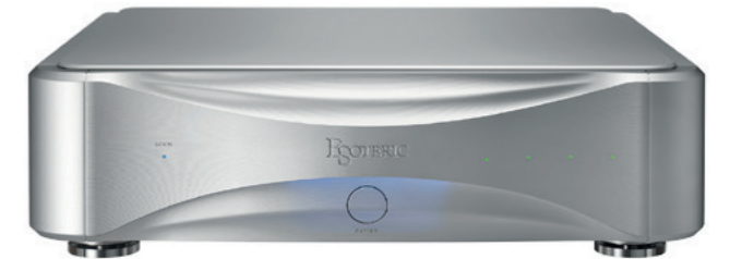
Grandioso G1 Master Clock Generator

Opening a new dimension for integrated amplifiers with silicon carbide MOSFET “ESOTERIC MODEL 200”, equipped with Class A power amplifier.