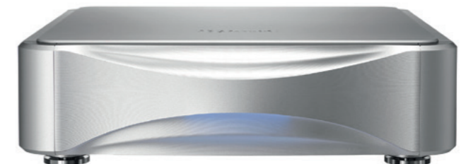
Grandioso PS1 External Power Supply

A dedicated external reinforced power supply unit that further enhances the music playback potential of the Grandioso K1X.