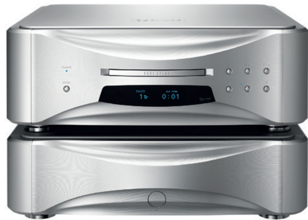
Grandioso P1X Super Audio CD Transport

Accommodating a newly developed drive mechanism the "VRDS-ATLAS", an ESOTERIC ultimate Super Audio CD transport.