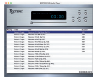
ESOTERIC HR Audio Player

Music Player Application (Complimentary)