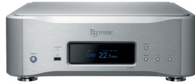
N-01XD Network DAC

A network transport unit that embodies the concept of separate components which is an invincible philosophy of ESOTERIC.