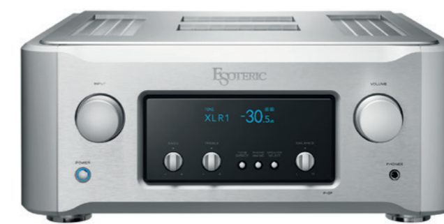
F-07 Integrated Amplifier

Fully balanced circuit design on preamplifier section. Employing a high power amplifier module inherited from the upper separate models.